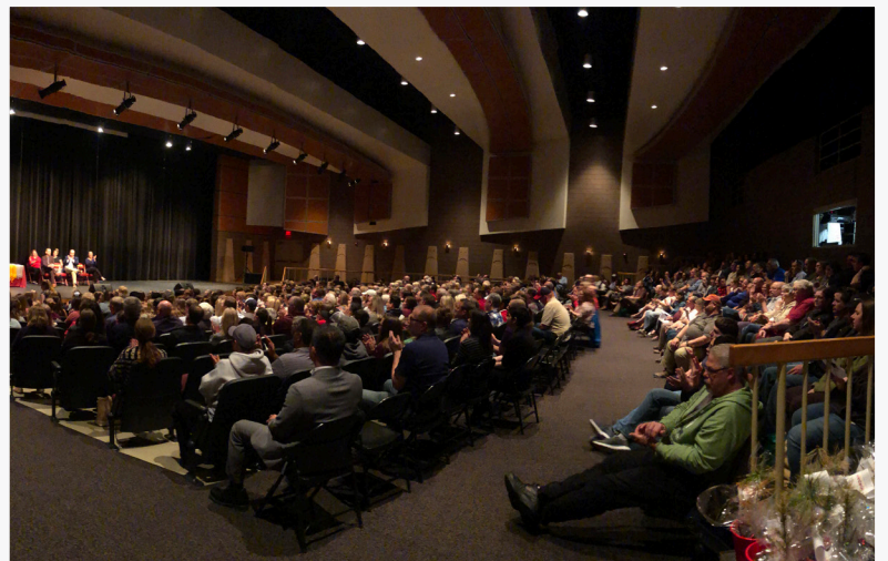
The 450-seat auditorium lacks the capacity to serve students, parents and community members who attend the numerous performances held in the auditorium. If more than 24 chairs are added, we violate Fire Marshal capacity limits. Often extra chairs are brought in to accommodate larger crowds.