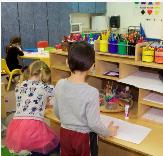
We've reached capacity at our PreK-4 building. In order to continue to build out programming, new space and the re-working of existing areas must occur.

Question 1 and 2 must pass for Question 3 to pass